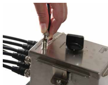
Step 2 - Connect the sensors to the switch box