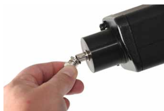
Step 3 - Connect an Ultraprobe to the box