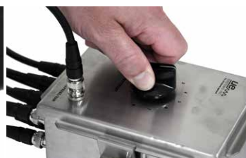
Step 4 - Switch through the points and take your reading