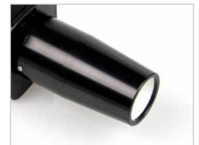
Close focus module