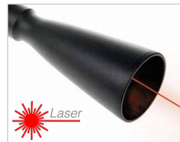
Long range module