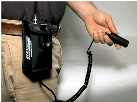
Holster for UP 201