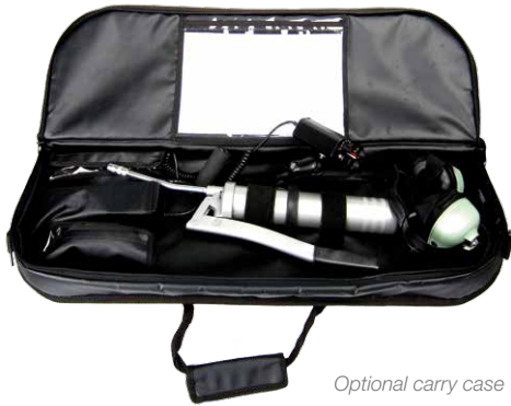
Optional carry case