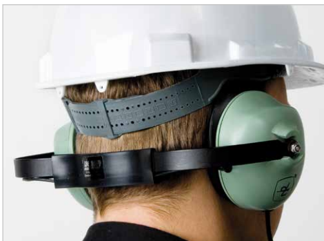
Headset for hardhat use