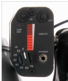
LED display and sensitivity dial